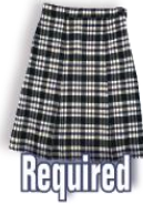
For all 6 th graders