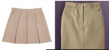
High School Only