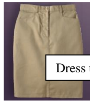
Dress uniform skirt HS