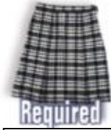
For 6 th grade 18-19